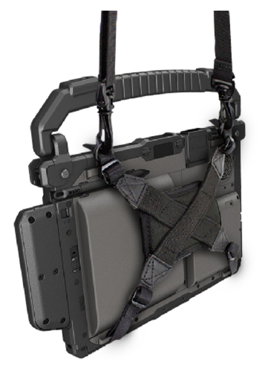
Shown with optional shoulder strap.