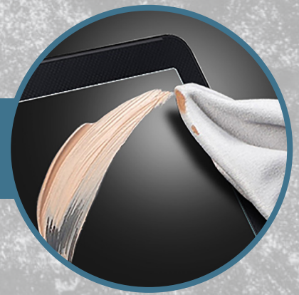
Oleophobic coating is resistant to smudge and fingerprint