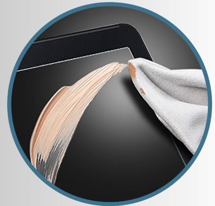
Oleophobic coating is resistant to smudge and fingerprint

We know your device screen is tough, but it is not indestructible. Avoid downtime, mitigate display replacement and extend the life of your technology investment by adding a stealth layer of display protection.