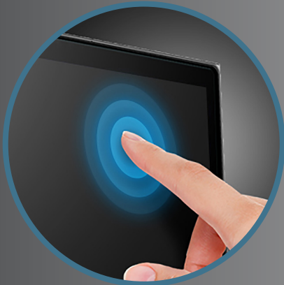
Touch and stylus compatible