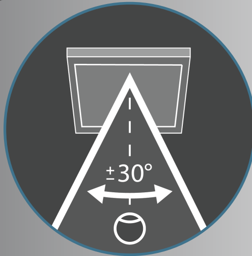
Multi-layer construction provides high impact resistance